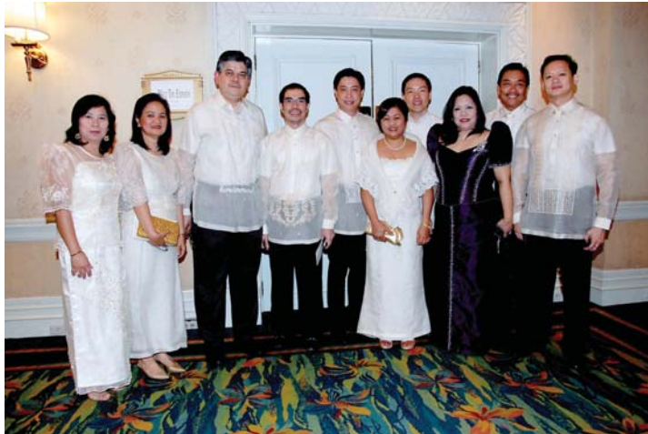
The Board of Directors of PSG 2009-2010