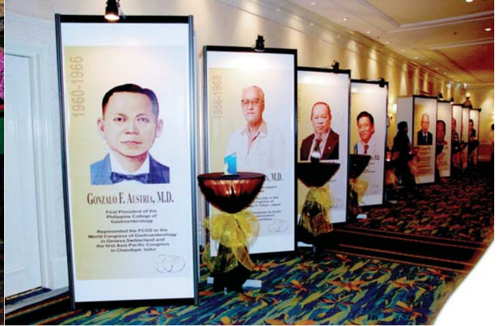
The Past Presidents of PSG.