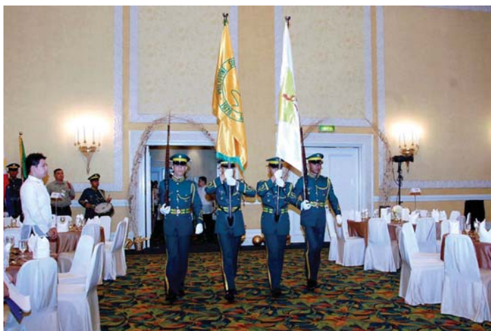
Parade of Colours during Fellowship Night