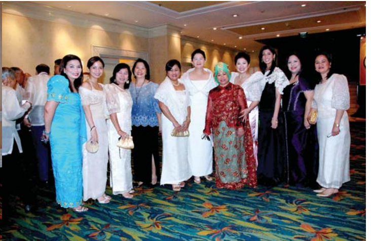
The Women of PSG