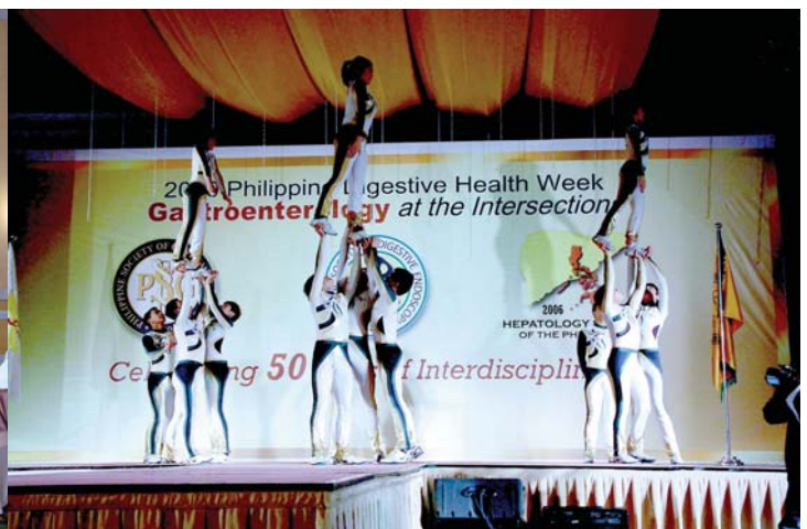
A captivating performance during Fellowship Night